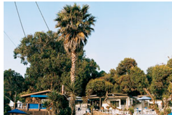
Vernacular architecture peeks out from overgrown vegetation.