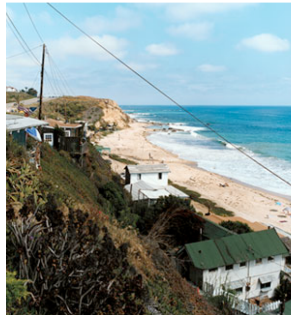
Hidden by the bluffs along Pacific Coast Highway, the rustic cottages of Crystal Cove are an island in time.