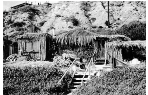
In the 1920s the cottages were draped in palm fronds to create a tropical backdrop for silent movies.