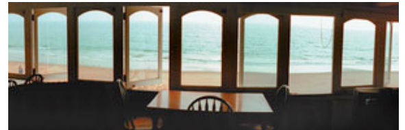
Windows from an old train car provide a panoramic view from one of the cottages today.