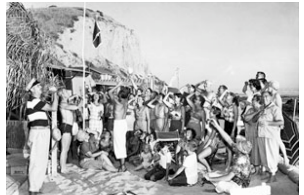
They appear patriotic, but these 1950s tent campers (above) are actually saluting the beloved martini flag, which bore the outline of a cocktail glass. A postcard shows the beach during its midcentury heyday, when tents lined the sand (below).