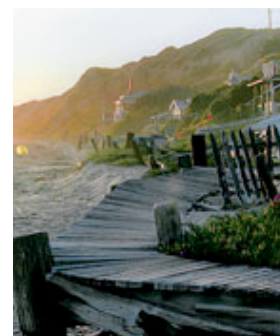
Clockwise from top left: A new high-end development looms across the highway from Crystal Cove; creeping iceplant turns lawn furniture and a bust of Beethoven into yard art; cottages on the sand can only be reached by the handmade boardwalk; a surfboard doubles as decor; a relic from the Yacht Club days, when neighbors gathered for cocktails under a thatched canopy on the sand.