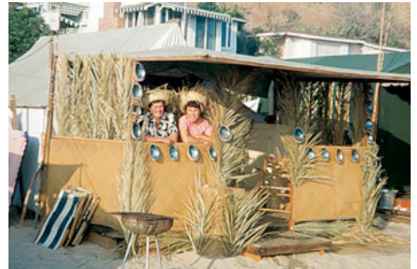
The author's grandmother and mother in their tiki tent, circa 1951.