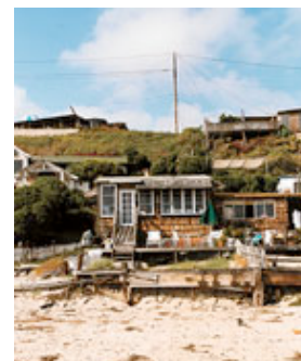
According to Cove legend,